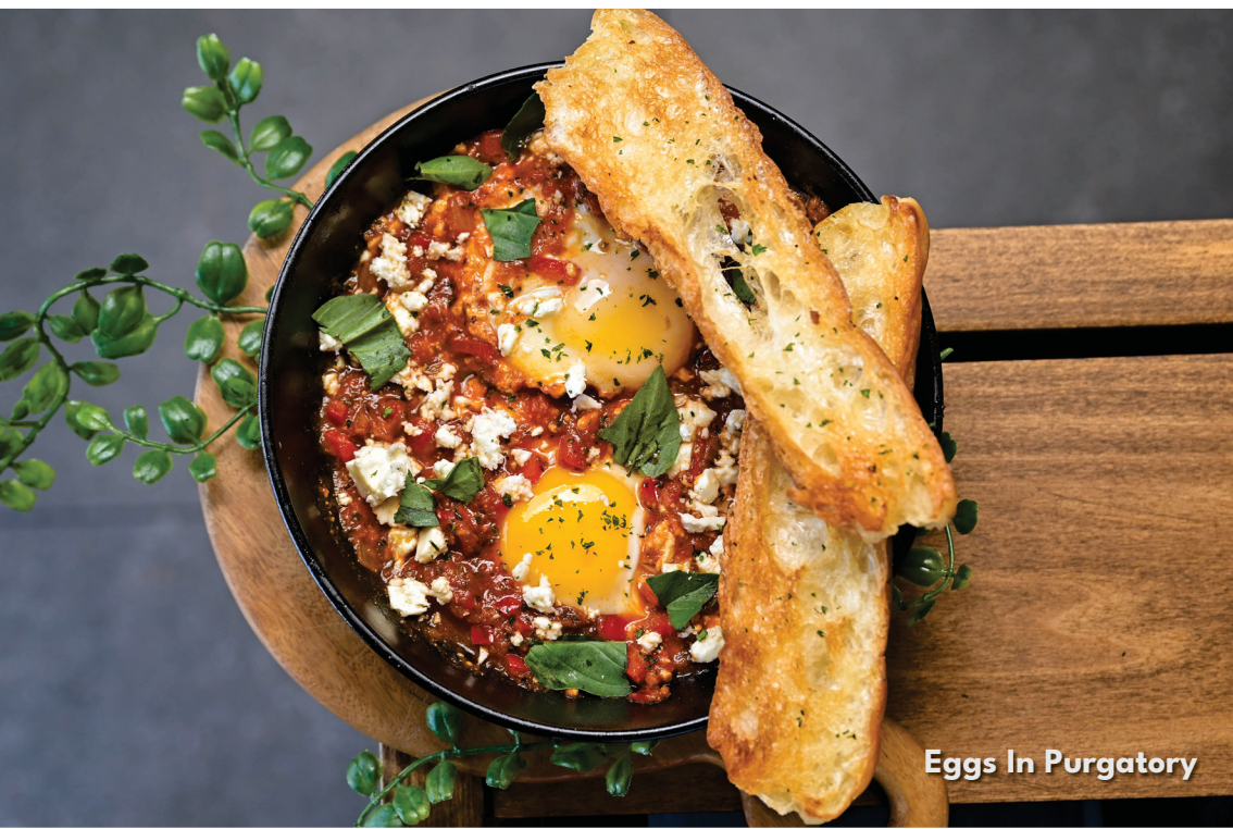
Eggs In Purgatory