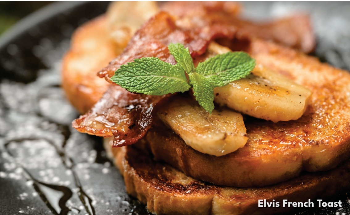
Elvis French Toast