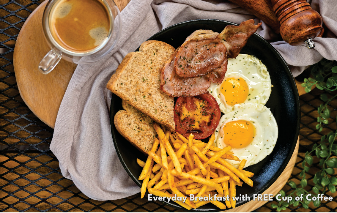
Everyday Breakfast with FREE Cup of Coffee