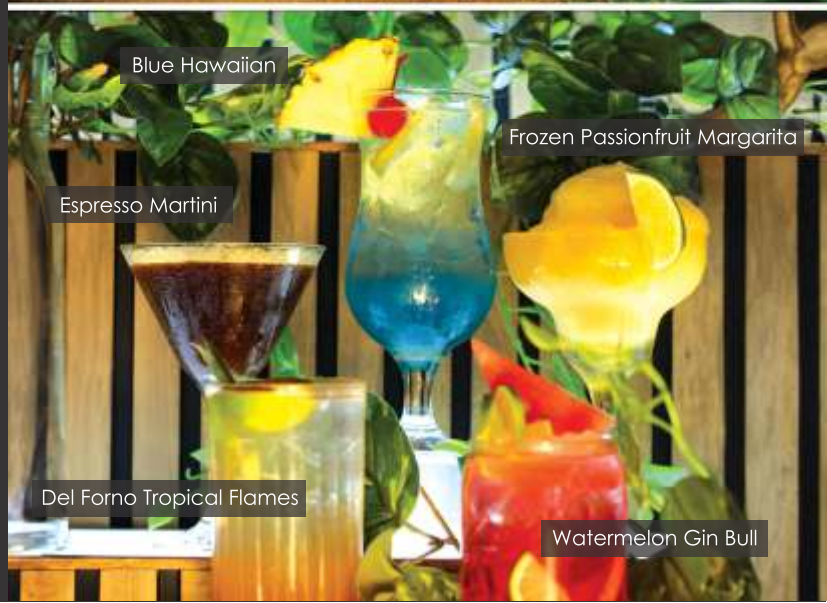
Watermelon Gin Bull